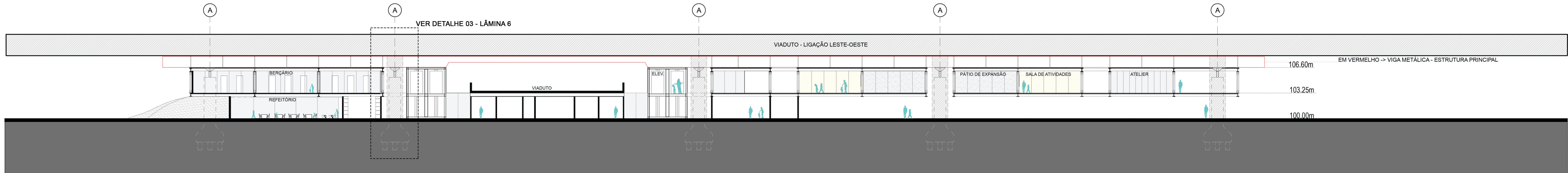
CORTE C-C' esc. 1:200